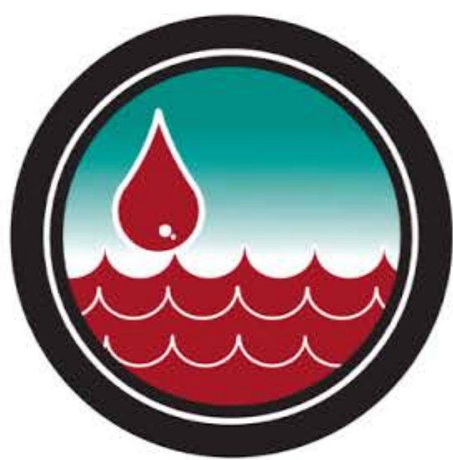
Waters Turn to Blood Exodus 7:14-25