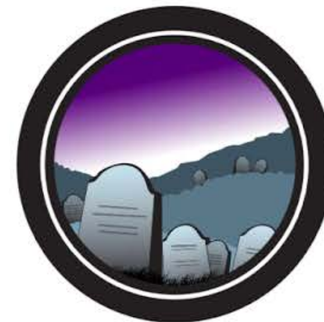
Death of First-Born Exodus 11:1-12:36