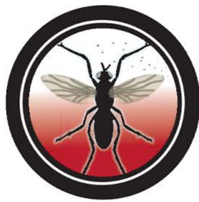
Gnats (Lice) Exodus 8:12-15