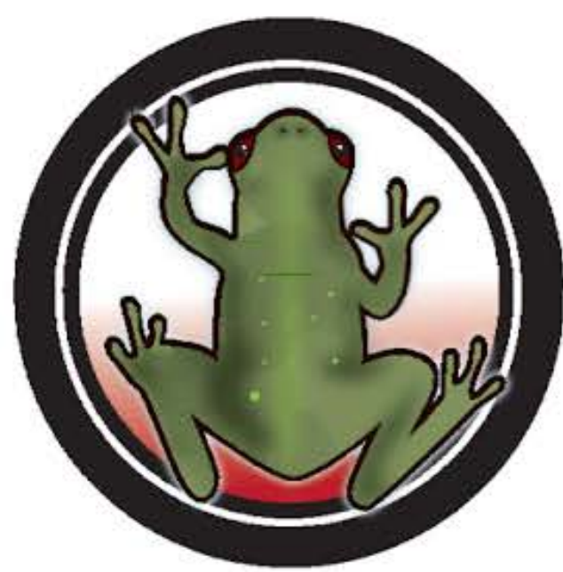
Amphibians (Frogs) Exodus 7:26-8:11