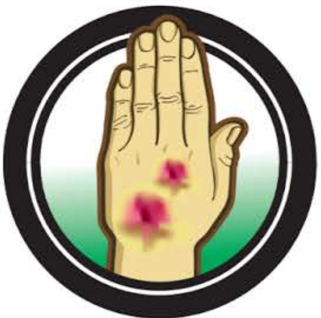
Unhealable Boils Exodus 9:8-12