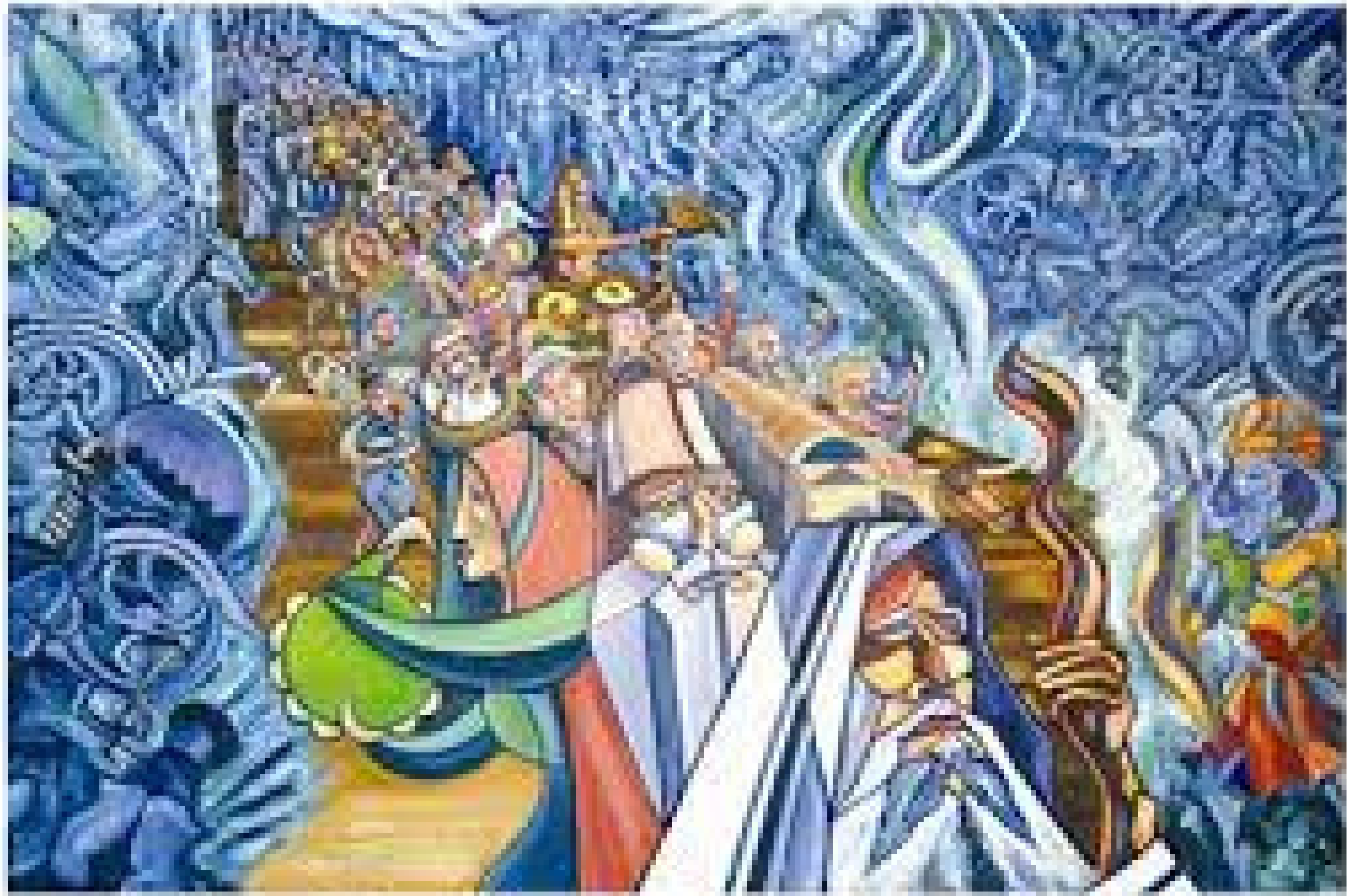
Crossing the Yama Suf