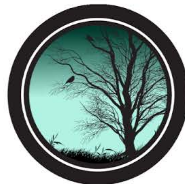
Darkness Exodus 10:21-29