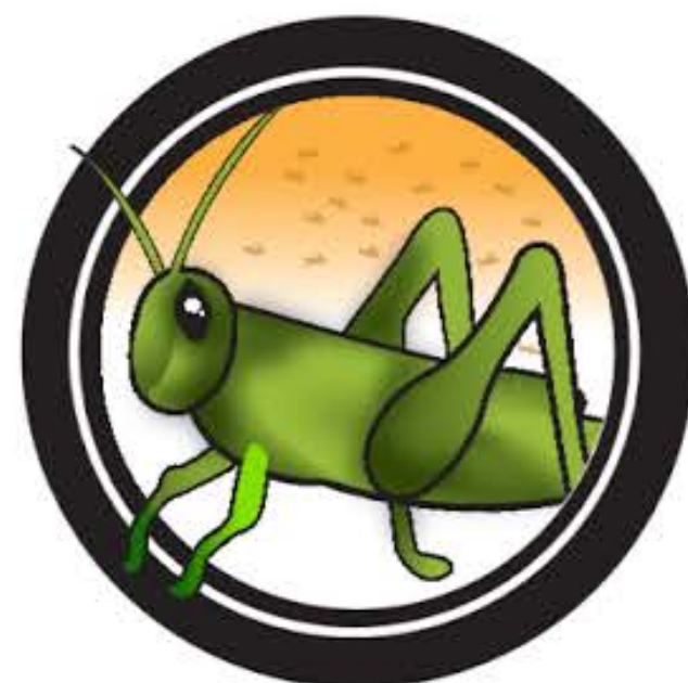
Locusts Exodus 10:1-20