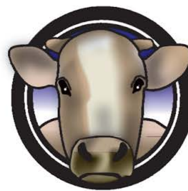
Disease on Livestock Exodus 9:1-7